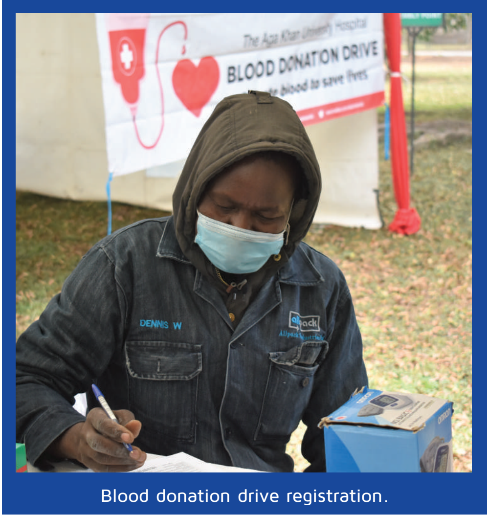
Blood donation drive registration.