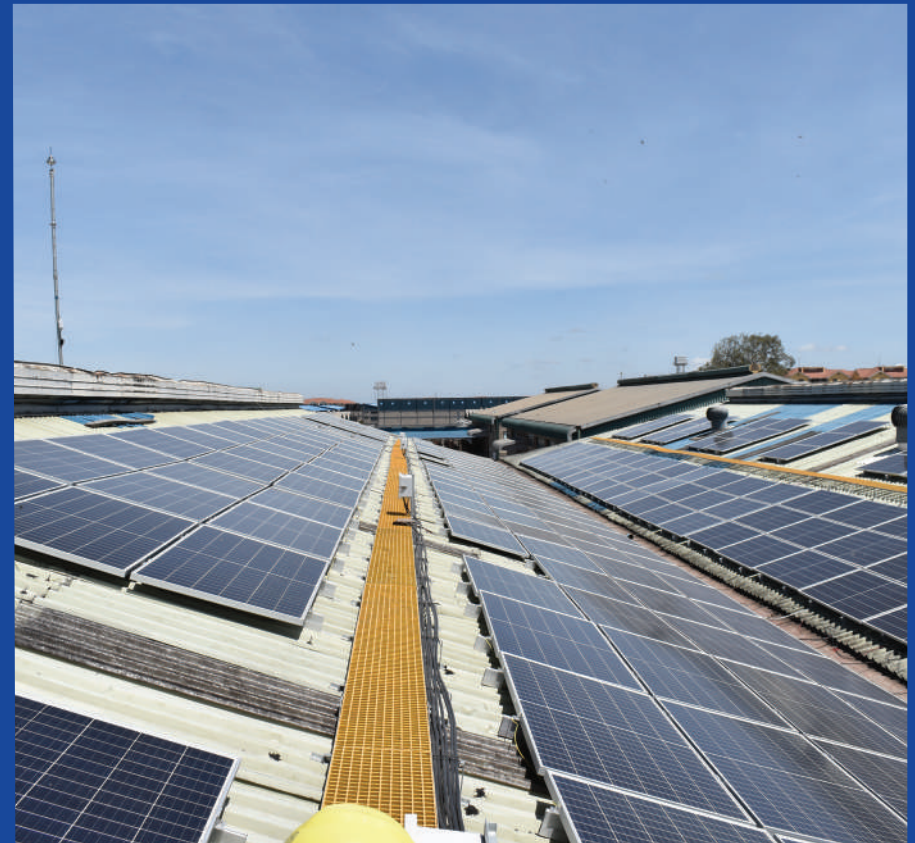
After installation of the solar panels.

Read More: https://ipskenya.com/videos/green-energy-for-industry/